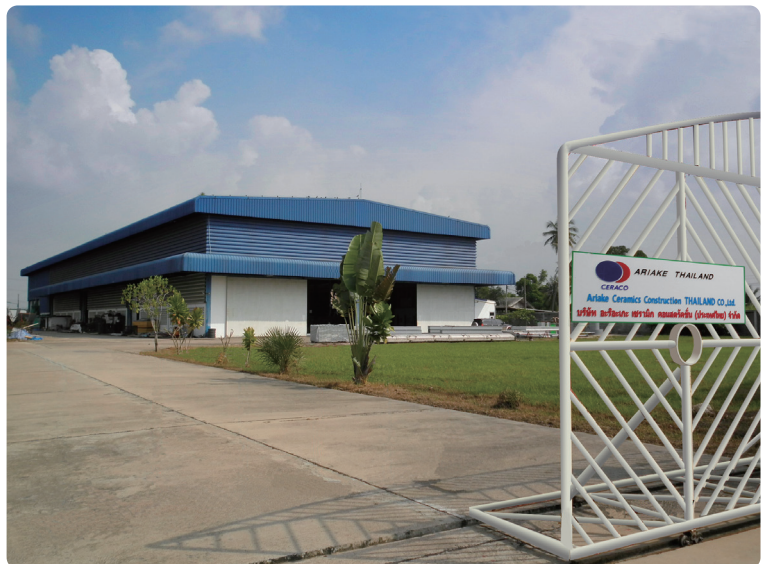
The Plant of Ariake Thailand

Recently, Ariake Thailand has started manufacture and sales of ceramics ladle cups, "Ceraco Ladle™", and began to supply them to aluminum die casting makers in Thailand. Ariake Thailand is also planning to manufacture Aluminum holding furnaces and melting & holding furnaces with Nicaceraco unit forming bath, to deliver them to automobile and die casting makers in thailand, and to import them to Japan.